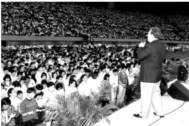
Rodney Howard-Browne Singapore, 1995