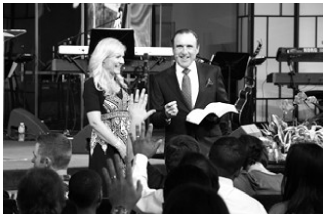
The River at Tampa Bay Church The Main Event, September 2014