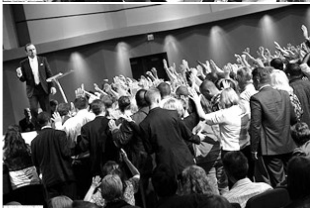
Revival Ministries International 50 Nights Campmeeting Lakeland, Summer 2014