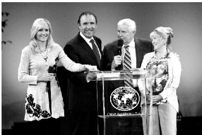
The Great Awakening Live Night 200, July 2011