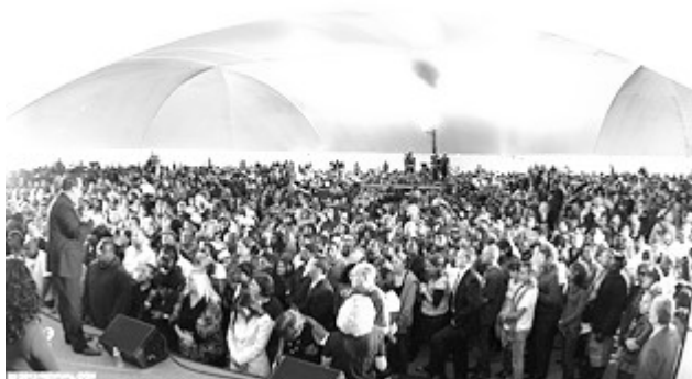
The River at Tampa Bay Church The First River Fest, January 2013