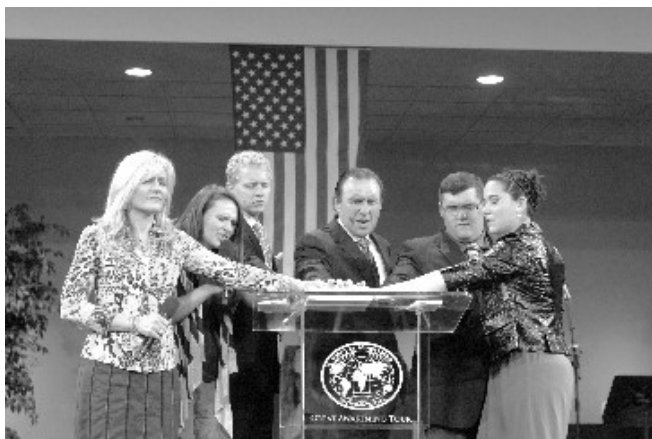
The Great Awakening Live Night 108, April 2011