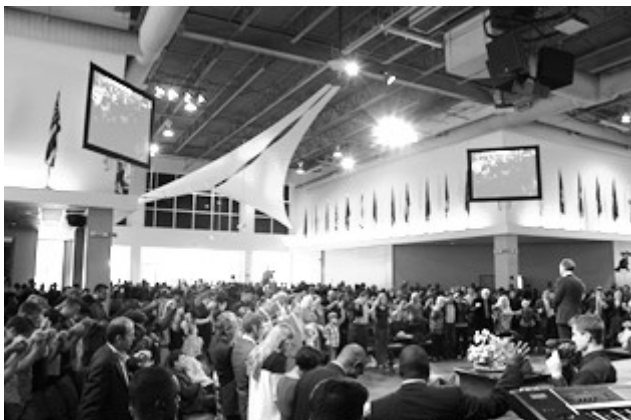
The River at Tampa Bay Church The Main Event, May 2014