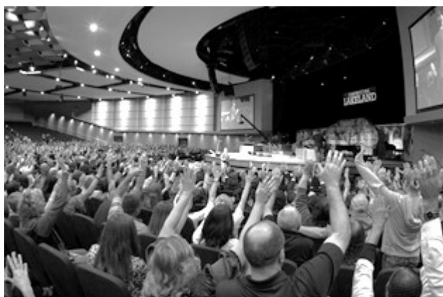
Revival Ministries International 50 Services Campmeeting Lakeland, Summer 2013