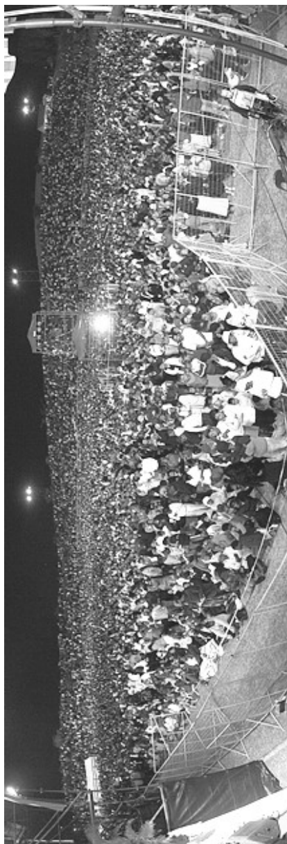
Good News Umlazi Umlazi, South Africa, 2005