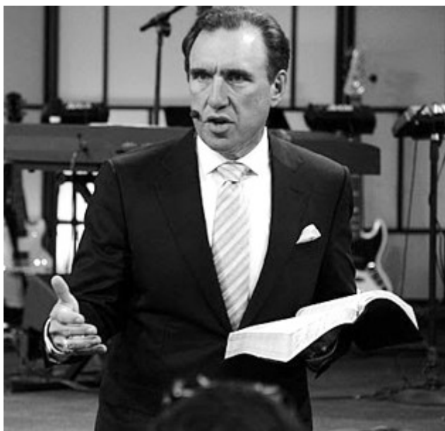
The River at Tampa Bay Church The Main Event, May 2014