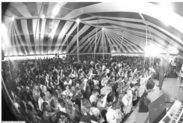
The River at Tampa Bay Church River Fest, August 2013