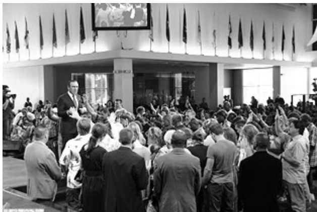
The River at Tampa Bay Church Easter Sunday, April 2014