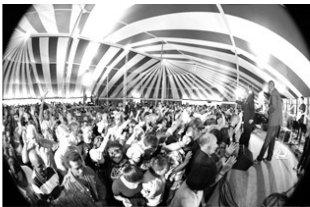
The River at Tampa Bay Church River Fest, February 2013