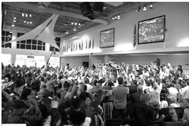
The River at Tampa Bay Church Thanksgiving Fest, November 2013